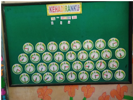
Fig. 3: Flannel board types of visual learning media. (D, GrA, 1)

Based on the triangulation of sources and techniques, it can be concluded that the research findings on what activities use learning media to develop soft skills are: (a) learning activities carried out by teachers using problem-based learning models, (b) types of media used in problem-based learning models. in the form of pair card media, and (c) social interaction and communication occurs when the use of pair card learning media between students and students and teachers.