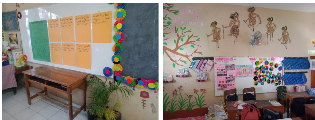
Fig. 4: Media display the results of student performance. (D, GrB, 2)