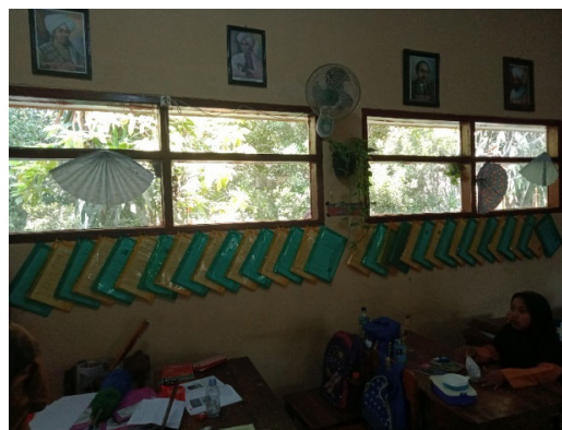
Fig. 5: Media portfolio map stores student portfolio results. (D, GrA, 3)

To strengthen the results of the interviews, the data collected from the documentation results in the form of photos of the portfolio map to store the portfolio works of the VA class students as follows in Fig. 5.