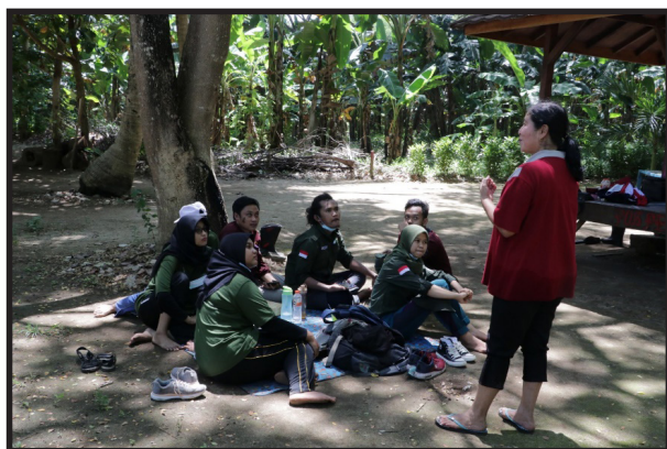
Figure 3: Reflection on the Planting Activities Completed