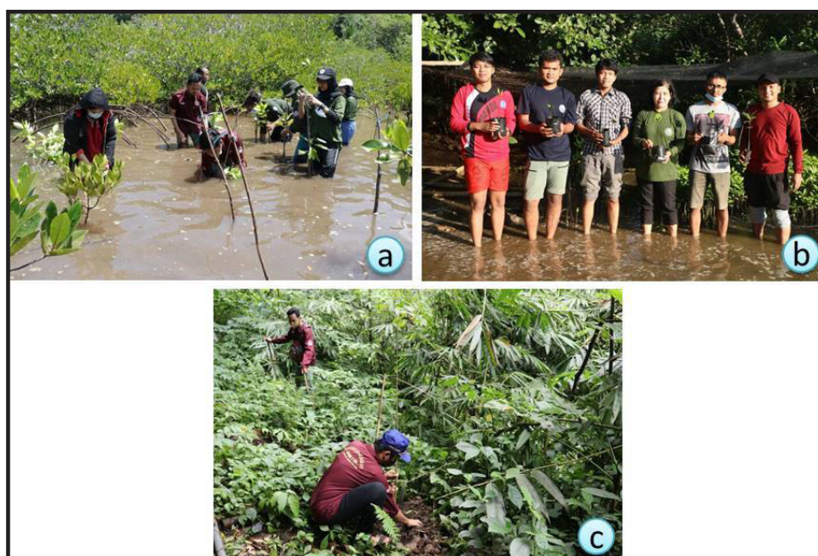
Figure 2 (A-C): (A) Planting mangroves at CMC Tiga Warna Sendang Biru; (B) Mangrove Seedling at Tamban Sendang Biru Beach; (C) Planting Mahogany Trees on Mount Penanggungan

Tests were conducted to measure the variables of environmental care and soft skills. This test is tested at the beginning of the meeting and the end of the environmental geography course. 5 questions were asked about the environmental care attitude, and 5 questions were asked about soft skills. Environmental care attitude and soft skills indicators have a maximum of 100 points. The measurement is divided into five categories: very good (81-100), good (61-80), moderate (41-60), poor (21-40), and very poor (0-20). The test instrument was developed based according to indicators of environmental care attitude by