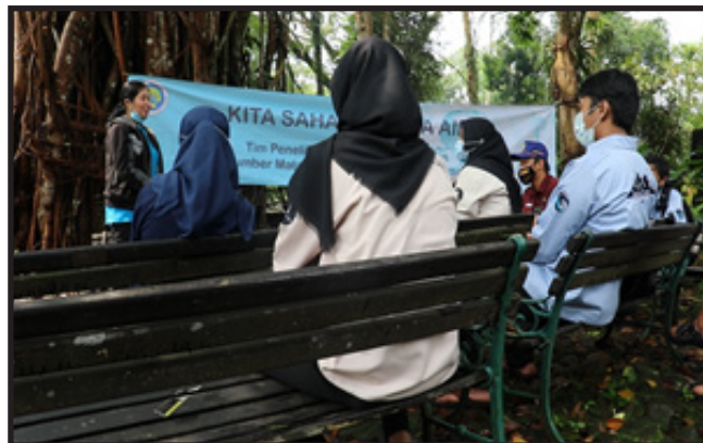
Figure 4. Submitting Reports to Lecturers about implementation and achievement on activity conducted