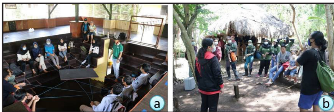
Figure 1: Preparation in CMC Tiga Warna

At this stage, each group of students has designed activities to solve the previously identified problems. The program carried out is planting mangrove seedlings and mahogany trees. This activity is shown in the following Figure 2.